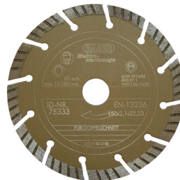
Diamond cutting blade