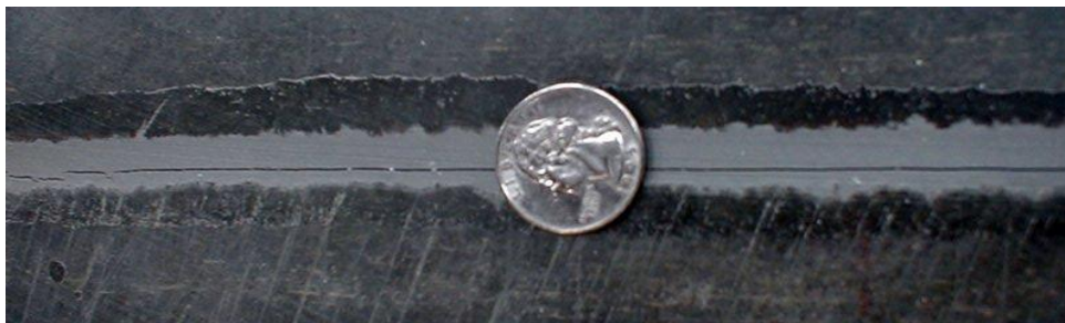
Early, Minor Separation Void – No maintenance generally required