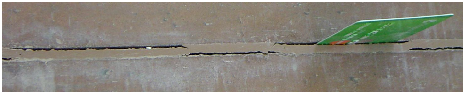
Separation Void at Credit Card Width 1/32” + Maintenance Suggested

If evidence of edge deterioration is present, voids should be cleaned and filled with a semi-rigid polyurea filler. Voids showing no evidence of compromising joint edge integrity should be monitored monthly to determine overall activity over a period of time. If voids remain at consistent width over the period of 6 months, refilling activity can be considered. But it is more likely that void dimension will open and close seasonally to some degree. If no signs of joint edge deterioration are present sanitation issues are not a concern filler separation voids generally will not require maintenance. If either concern is present, refill the voids.