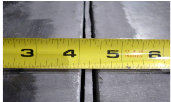
Right: Example of filler collapse in joint experiencing substantial opening...

Typical repair of joints exhibiting filler collapse involves removing existing filler, re-chasing or saw cutting joint to establish clean, structurally sound edges, and refilling the joint with a semi-rigid epoxy (ambient temperatures) or semi-rigid polyurea (freezer/cooler rooms or for faster access). If deteriorated joint width exceeds 1 ½” (38 mm) structural rebuilding of concrete edges may be desirable for optimal long term durability.