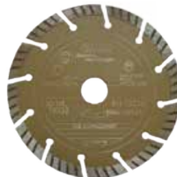
Diamond cutting blade