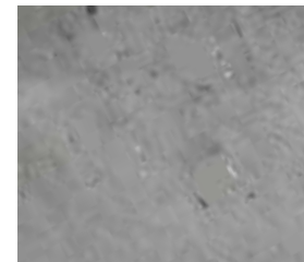
Ex. Surface Filled