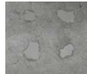
Ex. Surface Finished